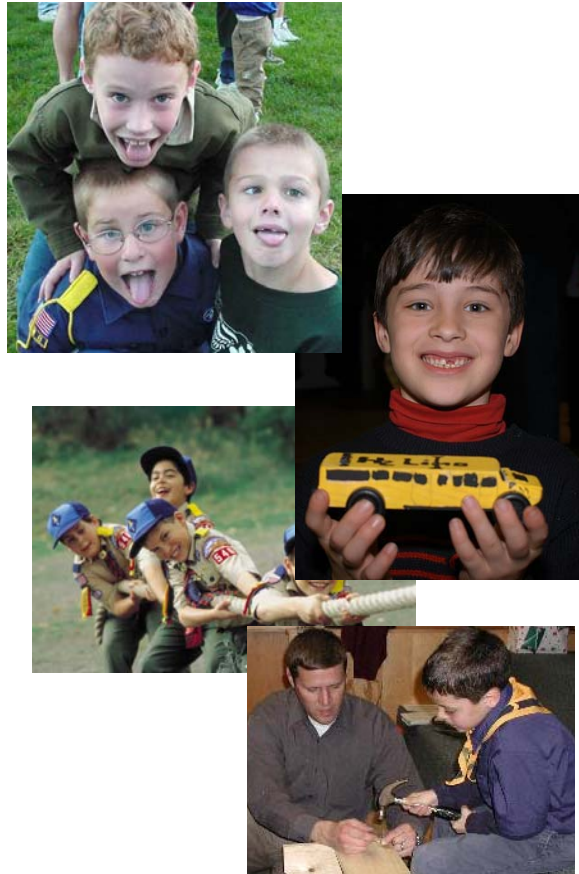
.... Cubs having Fun