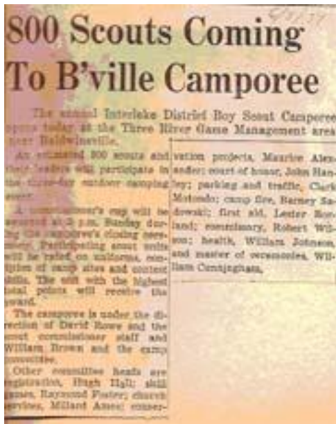
From the Syracuse Herald Journal, June 5, 1959