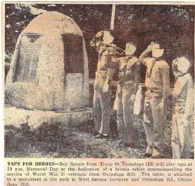
TAPS FOR HEROES —Boy Scouts from Troop 64, Onondaga Hill will play taps at 10 a.m. Memorial Day at the dedication of a bronze tablet commemorating the service of World War II veterans from Onondaga Hill. The tablet is attached to a monument in the park at West Seneca Turnpike and Onondaga Hill, Onondaga Hill.